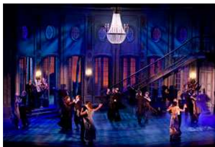
The Company of the Toronto production of The Sound of Music

The St. Lawrence Shakespeare Festival has a strong presence in the cast of the new $11 million production of The Sound of Music , now playing in Toronto.