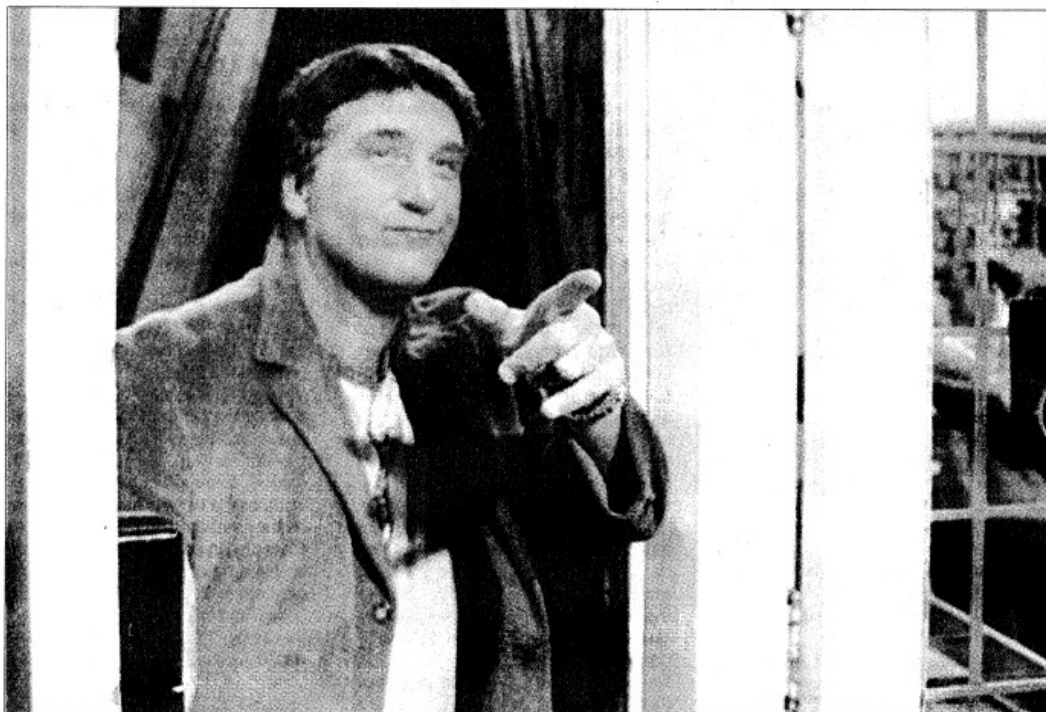
Daniel Baldwin appears in the film Sidekick , about a comic-book junkie obsessed with superheroes. More film fest stories / B3